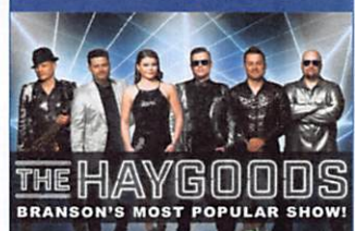
THE HAYGOODS SHOW

Departure: Family Bible Church, 15515 Husky Way, Evansville, IN @ 8 am