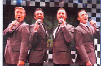
JERSEY NIGHTS SHOW