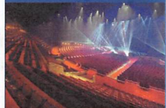
The Sight and Sound Theatre is State-of-the-Art